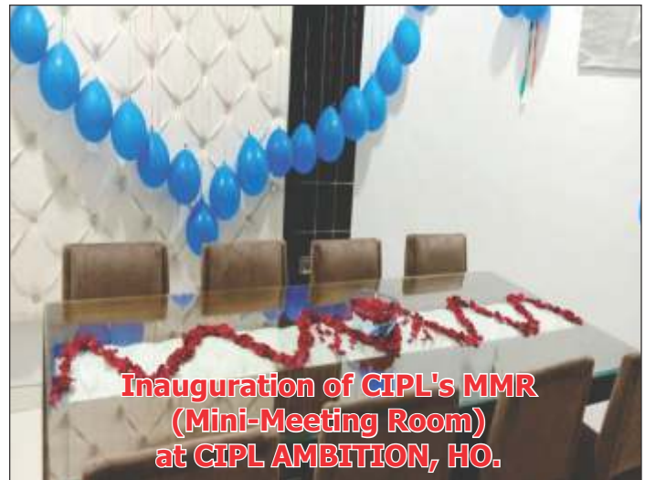
Inauguration of CIPL's MMR (Mini-Meeting Room) at CIPL AMBITION, HO.