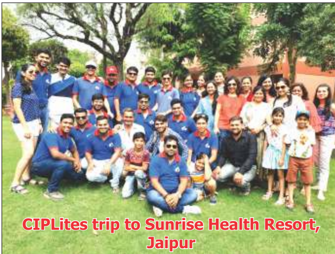
CIPLites trip to Sunrise Health Resort, Jaipur