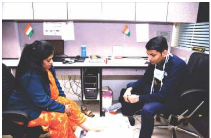
Bone Density (BMI) Test by representative of Shalby Hospital