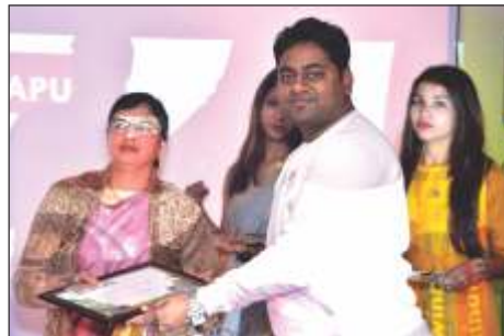
RAPU Team, “Best Quality Performer Team of the Year-2019 (Utility Shifting)”