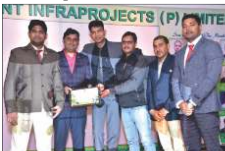
“More than 8 Years Bond with CIPL”