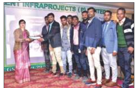
ATMS Gujarat Team, “Best Quality Performer Team of the Year-2019 (Highway Lighting)”