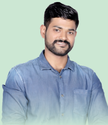
From Director's Desk