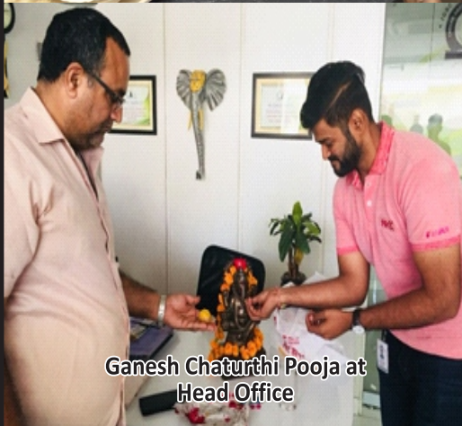
Ganesh Chaturthi Pooja at Head Office