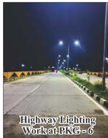
Highway Lighting Work at PKG-6