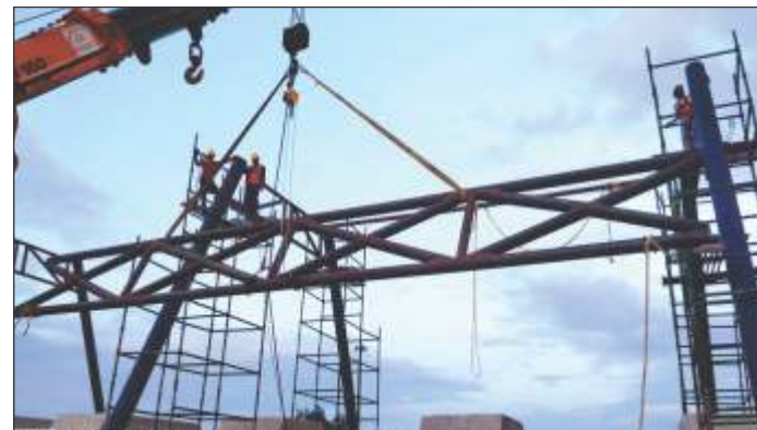
Installation of Toll Plaza Canopy at Chittorgarh - Udaipur Highway