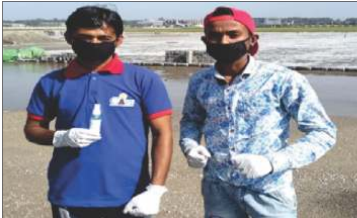
CIPLions wearing protective gears on-site

contribute in his/her own way. In conformity, with the recent outbreak of the COVID-19 (CoronaVirus), CIPL made sure that basic methods and ways to withhold the spread of the virus was followed both on-site and at the HO by sanitising its premises and keeping a tab on the health of its employees.