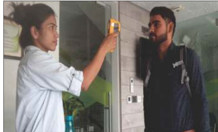
Regular monitoring of body temperature at HO-Jaipur