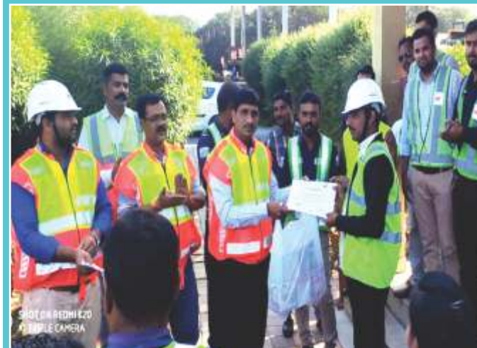
CIPL was awarded for Good HSE Practices in Gujarat ATMS Project