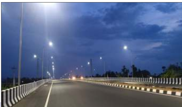
Street Lighting Work from Ranasthalam to Anandapuram

CIPL has been given the work of designing, supplying, installation testing and commissioning of electrical work of Parbatsar Project by Offshore Infrastructures Limited.