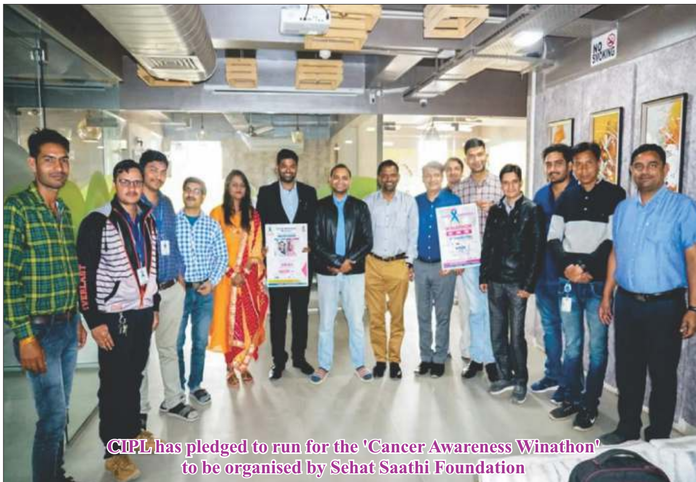
CIPL has pledged to run for the 'Cancer Awareness Winathon' to be organised by Sehat Saathi Foundation