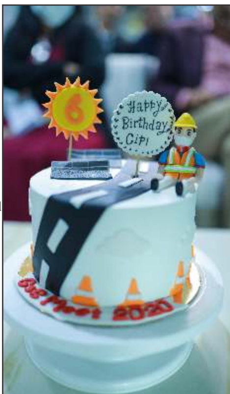
The GSG Cake