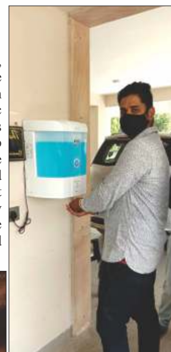
Touch free hand sanitiser