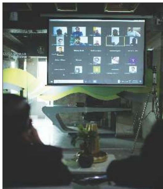
On-Site Employees joining via Zoom