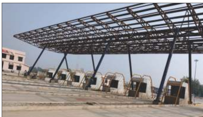
Installation of Toll Plaza Canopy at Chittorgarh - Udaipur Highway