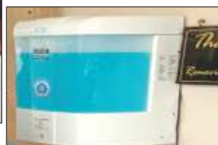
Automatic Hand Sanitizer Dispenser at HO.

During the COVID-19 pandemic, more than ever, protecting the health and lives of our employees is at the forefront. As it is rightly said, "Prevention is better than cure". Keeping this in mind, CIPL installed an automatic hand sanitizer dispenser at the HO premises. The contactless sanitizer dispenser can spray alcohol-based hand rub sanitizer solution for sanitization of hands while entering the office complex. This provides a quick and effective method for employees to ensure hand hygiene which is an important step towards fighting Covid-19. Regular screening of body temperature for everyone is done before they enter the office premises. The pulse-rate and oxygen level is also checked and monitored by our reception staff on a daily basis.