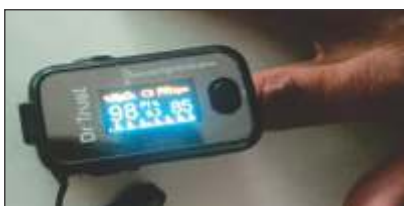
The Pulse-Oxymeter keeps track of the employees' oxygen level