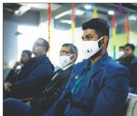
Masks with CIPL Logo were distributed