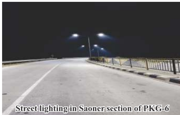
Street lighting in Saoner section of PKG-6