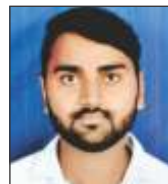
Bharat Raj Nagar