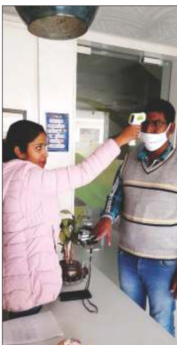
Daily Temperature Monitoring