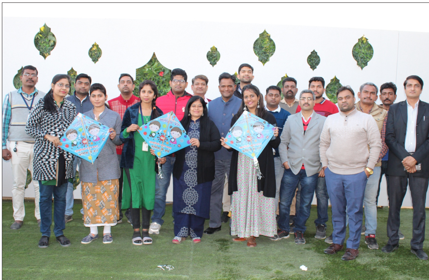
CIPLions celebrated Makar Sankranti at the newly opened Cafeteria – The Grub Club