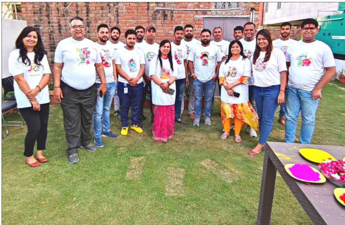
CIPL celebrated Holi at Head Office in custom-made t-shirts from Sniggle