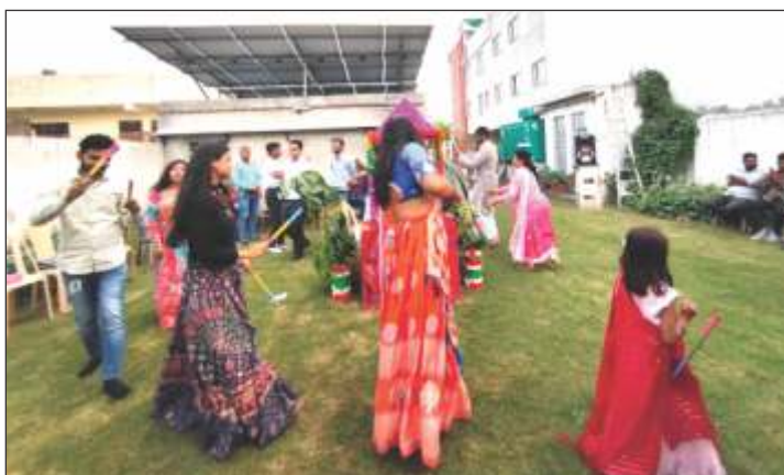
CIPLions Enjoyed Evening with Garba & Dandiya