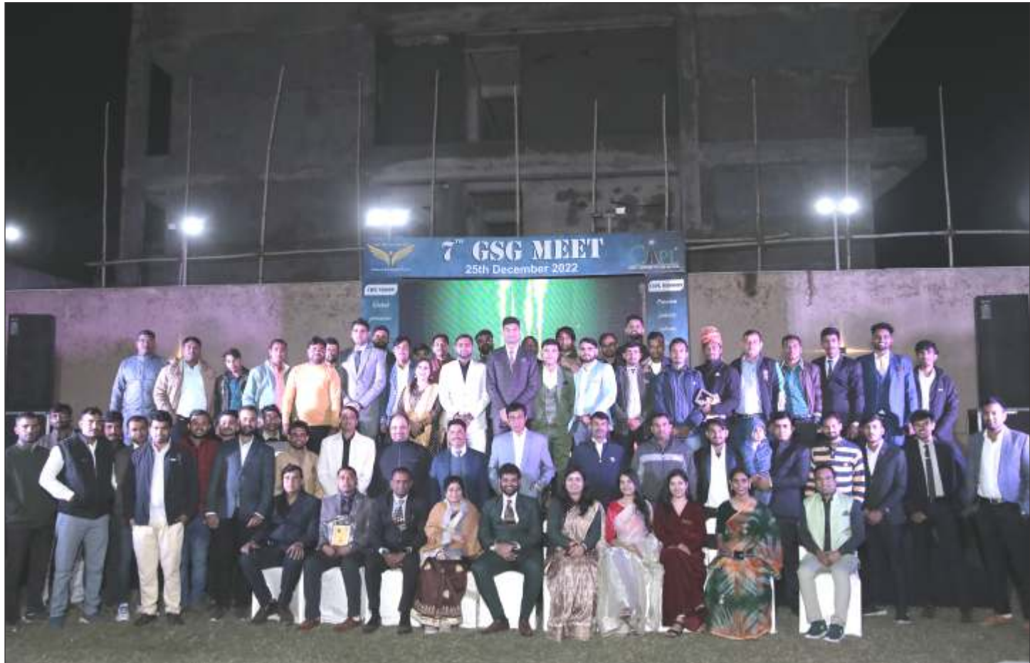
CIPL celebrated 7th Get Set Go (GSG) MEET 2022 at Sanskar Hotel, Jaipur.