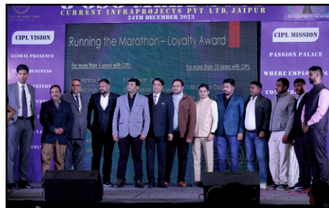
Winner of Running The Marathon - Loyalty Award