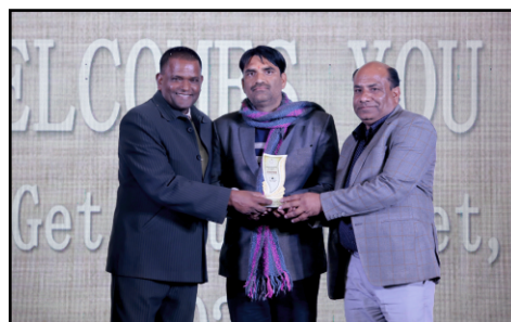
CIPL Partner Award