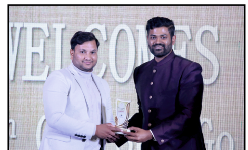
CIPL Partner Award