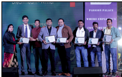
Winner of Dream Team Award Team UP